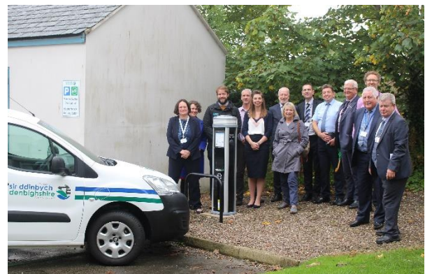
Working Group Members pictured October 2019

supported by officers. The Working Group is an advisory, non-decision making body but may make recommendations or requests to other Denbighshire County Council committees, panels, lead members or officers as appropriate. The Working Group will disband once the plan for the authority to become net carbon zero and enhance biodiversity by 2030 has been agreed or adopted by Council.