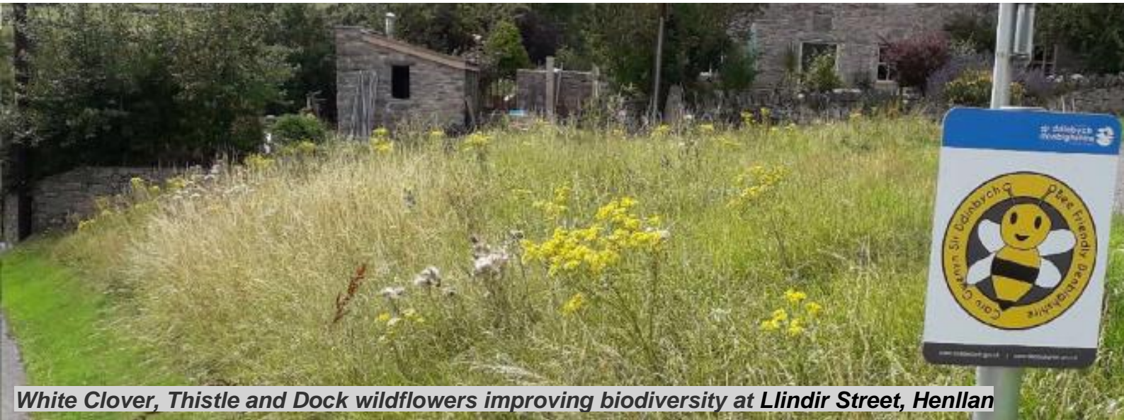
White Clover, Thistle and Dock wildflowers improving biodiversity at Llindir Street, Henllan

Welcome to the first instalment of the Climate and Ecological Change Newsletter for Members which will be sent out every 6 months to update on the Council's actions to respond to the climate change and ecological emergency.