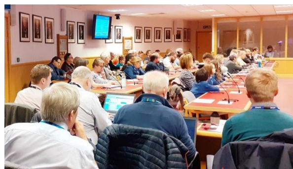
Public meeting held 25 th February pictured; 60 people attended in person & 104 watched live online

The intention is to consult with the public on the Council's draft Climate and Ecological Change Strategy and Action Plan in November and seek approval and adoption at Cabinet and Full Council in January.